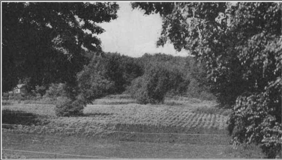
Fig. 1.—Field of Ammi visnaga , Foxglove Farm, August 1931.

The earliest reference to the chemistry of Khella is that of Ibrahim Mostapha who isolated a crystalline substance with glucosidal properties. Later Malosse